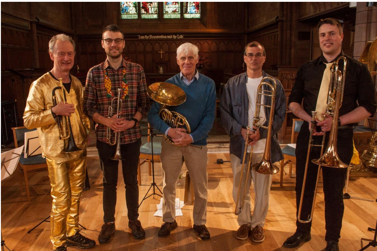
The Brass Quintet who gave an excellent concert in aid of Morningside Hope on 28 May. A full report of the concert will appear in the September magazine.