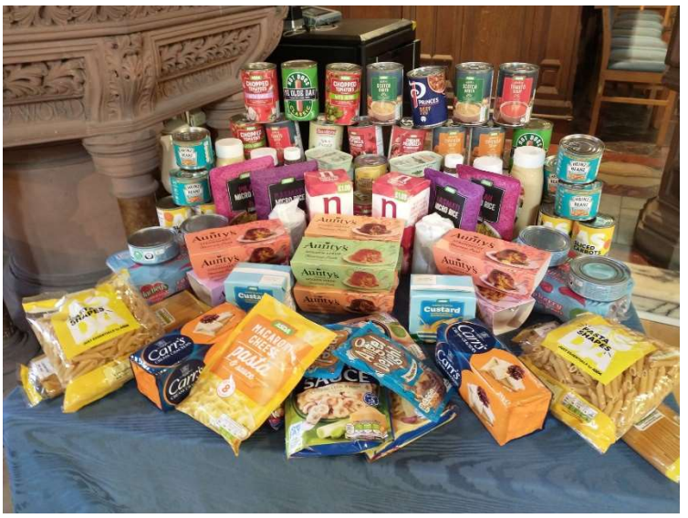
Edinburgh: Morningside Parish Church of Scotland: Scottish Charity No: SCO34396