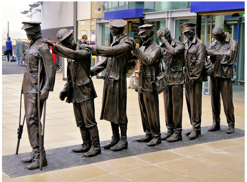
Victory Over Blindness, Manchester (1)

Does it matter? – losing your sight?... There's such splendid work for the blind; And people will always be kind, As you sit on the terrace remembering And turning your face to the light.